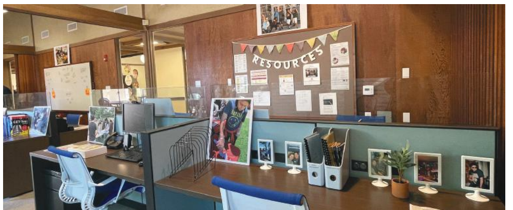
The Steve and Mary Brockmeyer College to Career Office