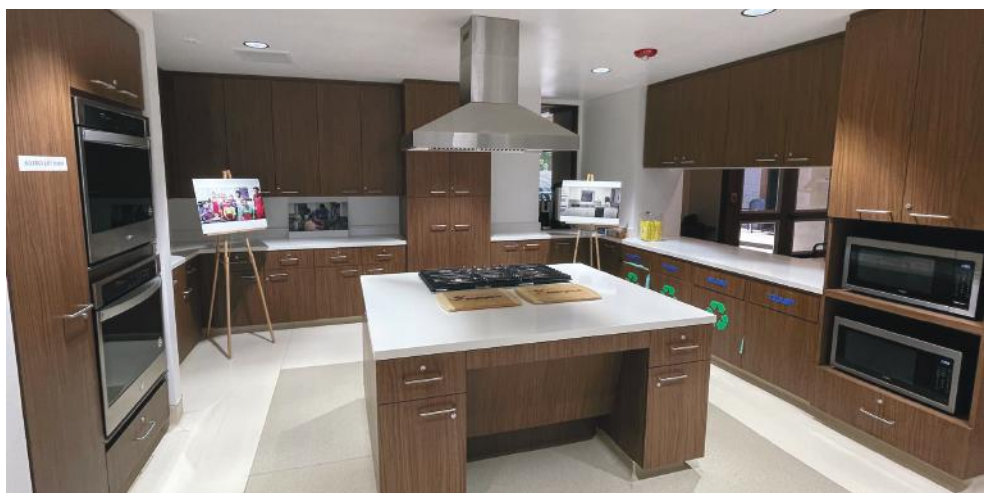
The Richard R. Frank Teaching Kitchen