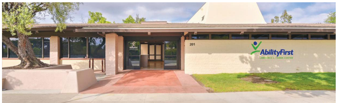
The Lawrence L. Frank Center