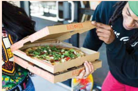
The AbilityFirst Food & Wine Festival features gourmet food, craft cocktails, wine and beer tastings while you relax and mingle with friends – all while supporting AbilityFirst programs for people with disabilities.