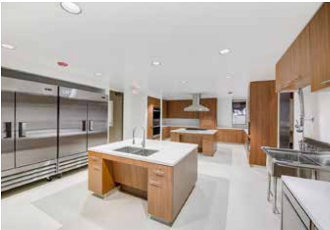
Lawrence L. Frank Center teaching kitchen

The Long Beach Center broke ground in January 2021 with a goal of completion in June 2022.