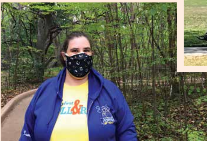
The AbilityFirst Stroll & Roll is a yearly fundraiser involving nearly 1,500 participants and their families, dozens of corporate sponsors and teams, and community supporters who come together to walk or stroll & roll while supporting our mission.