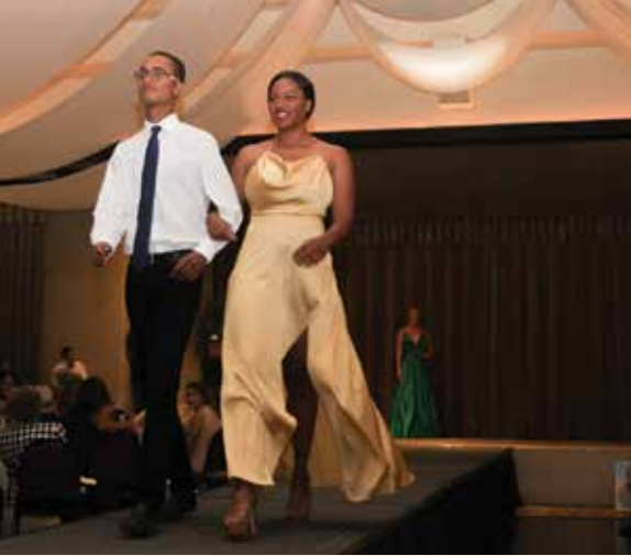
Long Beach Guild of AbilityFirst celebrates children and adults with developmental disabilities with its annual Rainbows for AbilityFirst Luncheon.

We are deeply grateful for the support from AbilityFirst Event Committees, who volunteer their time and resources for major, annual events. All while having fun and raising critical funds for programs and services that enrich the lives of children and adults with disabilities, and their families.