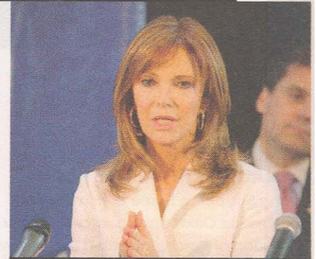
AbilityFirst honorary chairperson Jaclyn Smith speaks at the "Expanding Possibilities" luncheon

"Expanding Possibilities" Award for employing individuals with disabilities. AbilityFirst provides programs and services to help children and adults with physical and developmental disabilities realize their full potential. AbilityFirst Employment Services provides the support individuals with