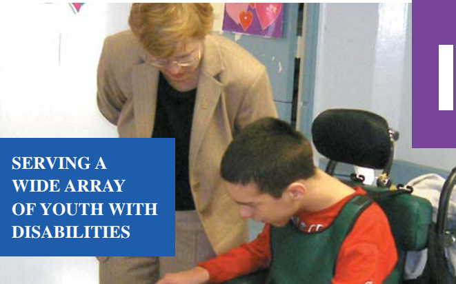
SERVING A WIDE ARRAY OF YOUTH WITH DISABILITIES

Our Anaheim Center serves a wide array of youth with varying degrees of disabilities. Some participants are fairly independent while others are assisted with personal care and feeding. All have achieved remarkable growth in their abilities and skills, in part through the efforts and talents of AbilityFirst's trained staff.