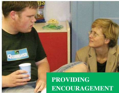
PROVIDING ENCOURAGEMENT AND CHOICE

I had the pleasure of visiting AbilityFirst's after-school program in Anaheim the day after the annual ski trip to Big Bear Mountain. The children were very excited to talk about their wonderful day on the slopes and the bus ride along with children from the AbilityFirst Long Beach and Newport Mesa Centers.